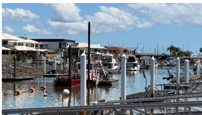
Photo 1: Dredge vessel and dredging operation at Walkers Creek Canal (Zone 2)